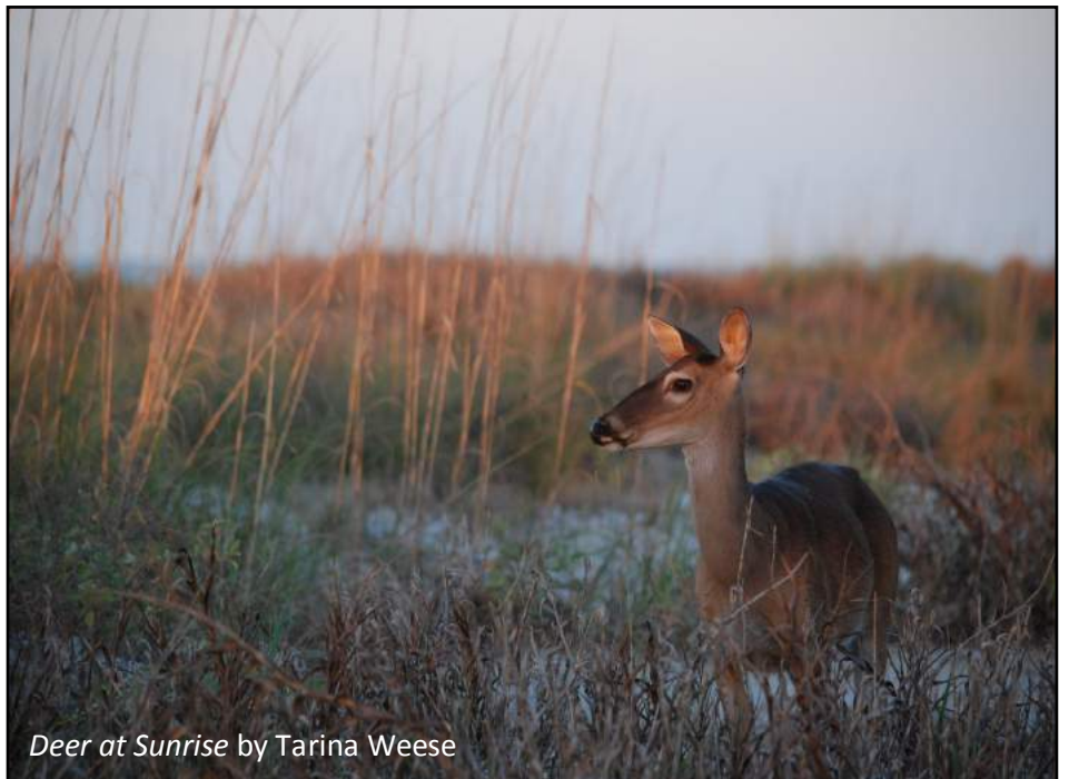
Deer at Sunrise